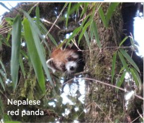
Nepalese red panda