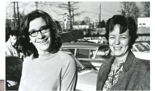
Happy Drew days in the early 1960s